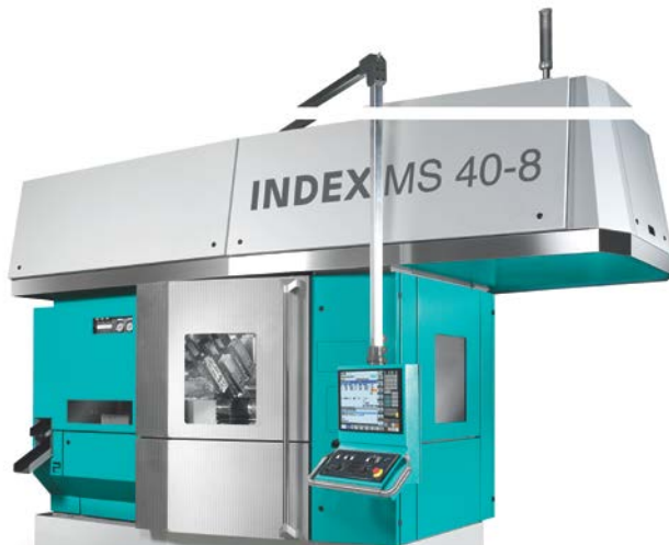
Figure 1 (machine photo):

Versatile usage options: highly productive as a double four-spindle machine – for simple to medium-complex parts – or as an eight-spindle machine for complex parts